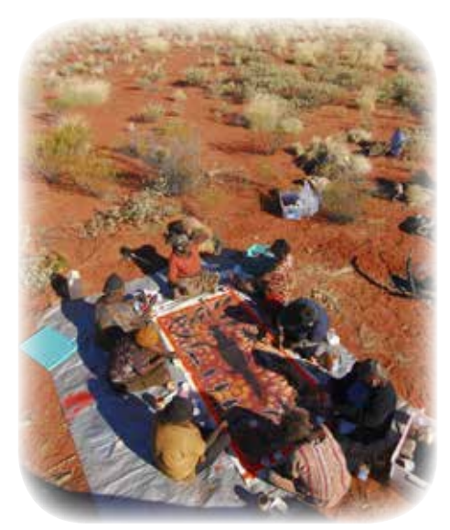
Warakurna Aboriginal women collaborating on a painting.

"The exhibition is a fantastic way of helping all Australians understand the complex history of Warakurna," Ms O'Brien said.