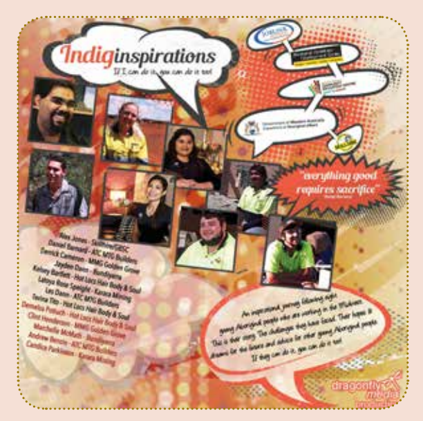
Indiginspiration now on Vimeo.

You can now watch each individual young person's story on the Vimeo Channel by visiting: <a href="https://vimeo.com/channels/">https://vimeo.com/channels/</a> indiginspirations